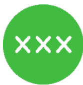
Pornography & Adult Nudity