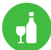
Alcohol & Tobacco