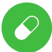
Drugs & Criminal Skills