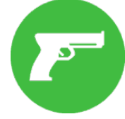
Weapons & Violence; Gore & Hate