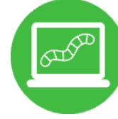
Phishing & Malware Infected Sites