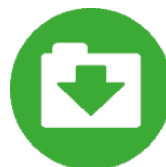
Filesharing & Hacking