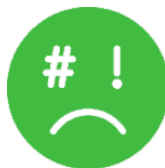
Suicide & Self-Harm