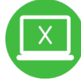
Pornography & Adult content